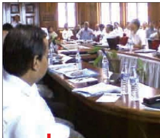
SIO, Manipur demonstrate Web based Monitoring of NLCPR scheme during the Workshop-cum-Training held on 29-07-2011 at Manipur Secretariat

Utilization Certificate, Quarterly Progress Report (UC/QPR) etc. Similarly it was envisaged that all the line departments would do data entry of their activities right from submission of DPR, receipt of funds etc to submission of UC/QPR. In short, all the required data will be made available in the server. Various reports are generated from the system which are referred by the administrative heads any time anywhere. On behalf of DoNER, Planning Department will make data entry whenever there is approval or sanction of the schemes.